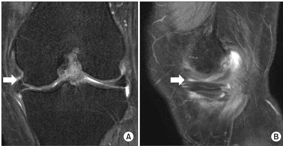
Figure 1. (A) In coronal T2-weighted magnetic resonance imaging (MRI) an additional meniscus was observed in the medial meniscus (arrow). (B) In sagittal T2-weighted MRI there was upper meniscus on lower meniscus (arrow).