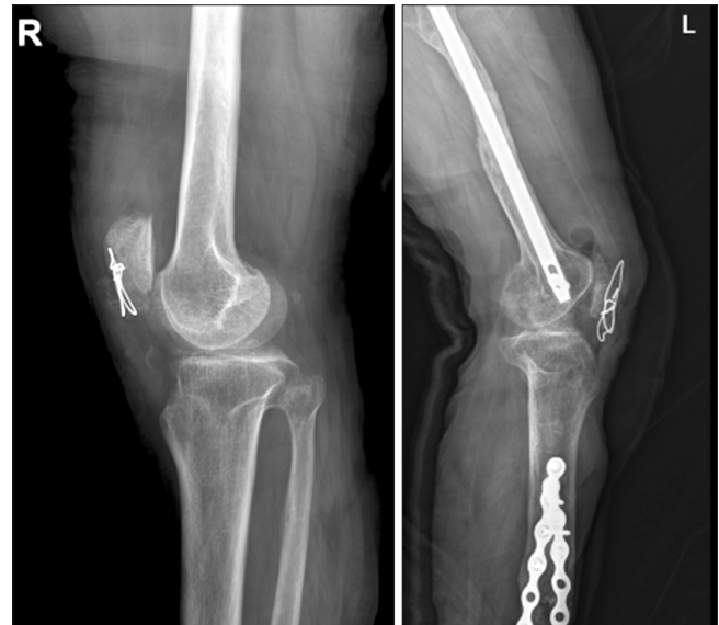
Figure 3. Postoperative radiographs. The repair was done on both sides using Ethibond suture for patellar tendon rupture with an additional wire loop to fixate the fragile patella.