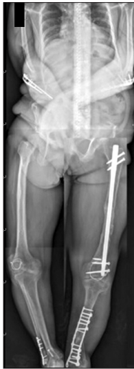
Figure 5. The patient had been admitted to the hospital 13 times in the past for multiple fractures.

form a biomechanical functional complex that transmits the contraction of the quadriceps muscle to the tibial bone, allowing extension of the knee joint. 2) Injuries to this complex can be caused by direct or indirect trauma and usually involves the patella bone. The vast majority of patellar fracture occurs unilateral. 2) In very rare cases, however, patients may present with simultaneous bilateral tendon ruptures.