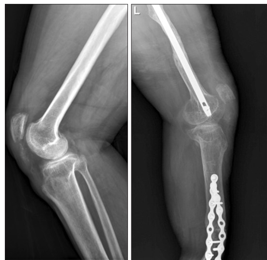
Figure 1. Plain radiographs showed patella alta and fracture of the patellar inferior pole on both sides.

A 55-year-old female admitted to our hospital due to bilateral knee pain. The pain occurred during working without obvious trauma episode. She had no history of anterior knee pain prior to this event. She had notable bruises and swelling on both knees, and was unable to raise thigh on both legs. Plain radiographs revealed patella alta and fracture of patellar inferior pole on both sides (Fig. 1). Computed tomography scan was taken on both knees and magnetic resonance imaging was also performed on the right knee (Fig. 2). The radiologic finding suggests the identical avulsion fracture of