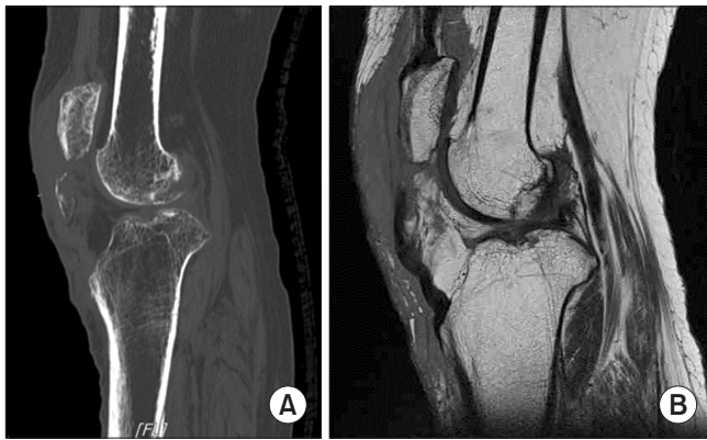
Figure 2. Computed tomography scan was taken on both knees and magnetic resonance imaging was also performed on the right knee. (A) The identical avulsion fracture of patellar at the inferior pole on both knees. (B) Patellar tendon rupture on the right knee.

The quadriceps tendon, the patella bone, and the patellar tendon