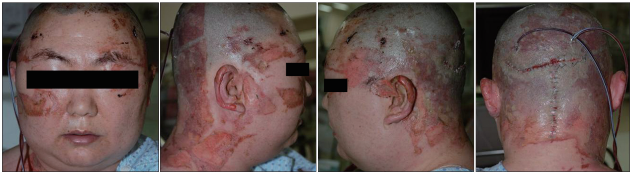
Fig. 2. Patient suffered second-degree burns on his cheeks, forehead and about 40% of the scalp.

flame in the fire. After the fire was extinguished immediately using saline, the surgical drape was removed.