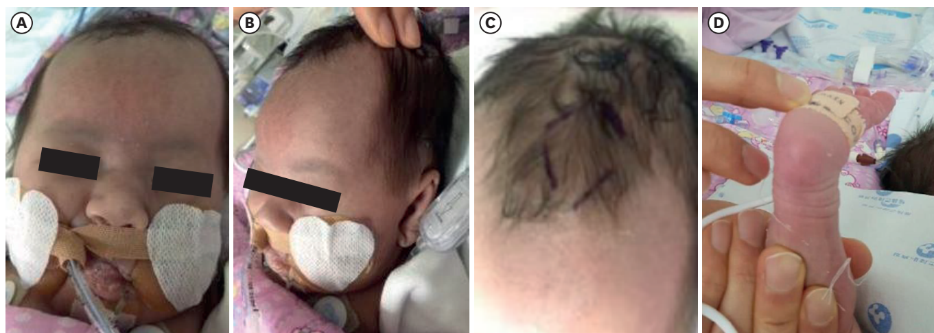
Fig. 1. Clinical photographs of patient. Patient showed (A) typical box-shaped face, (B) large fontanelle, (C) midfacial hypoplasia, and (D) club foot. The figures are published with agreement of parents.

Intolerant From Tolerant, and MutationTaster and classified as likely pathogenic. Although we could not perform the enzyme analysis for 3-HAD and 2-enoyl-CoA hydratase, we assessed the patient as a type III DBP deficiency through the genotype of HSD17B4 (Fig. 2D).