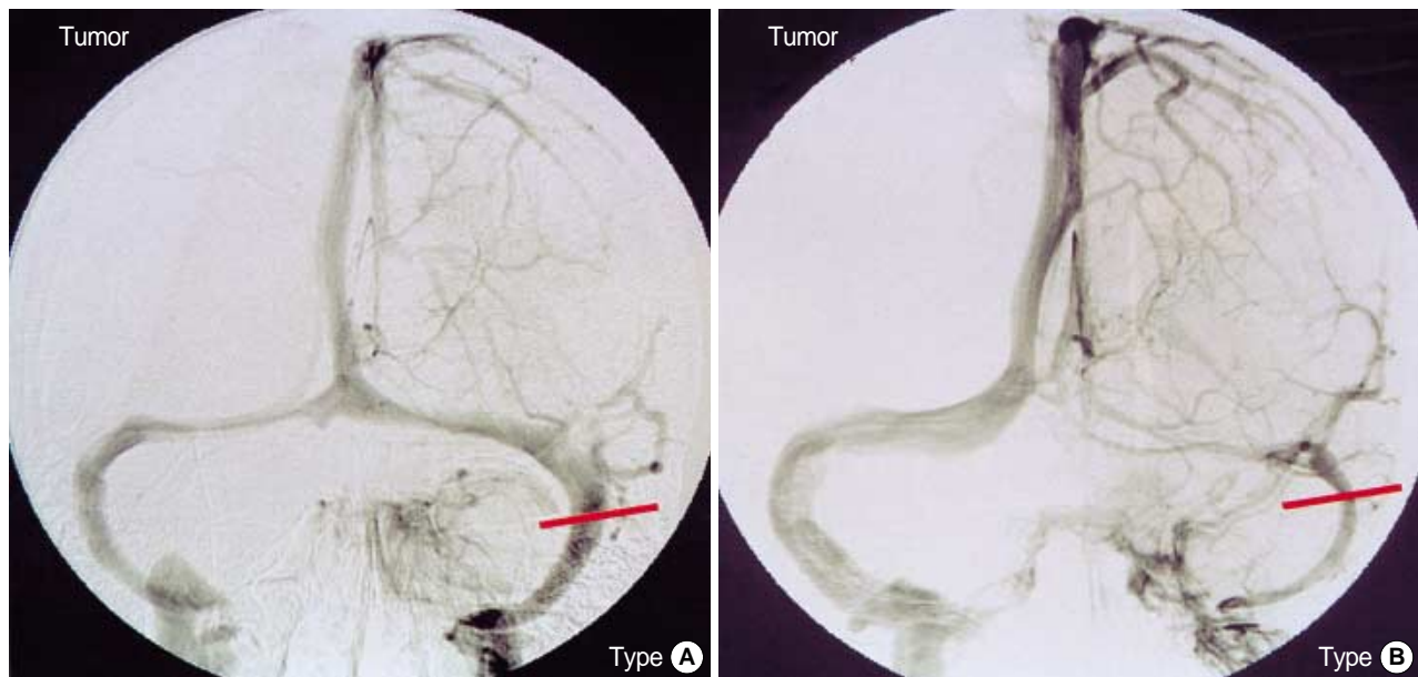
Fig. 1. Venograms demonstrating the types of confluents of Herophili. Type A: confluence on both transverse sinuses. Type B: confluence and non-dominant transverse sinus. Bar indicates the ligation of sinus.

We analyzed the venogram of the 11 patients, and reviewed the location of the tumor and the drainage pattern of the con-