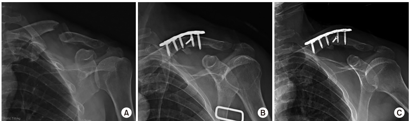
Fig. 1. Left clavicle anteroposterior views. (A) Initial injury radiograph. (B) Immediate postoperative radiograph at another hospital. (C) 5-month postoperative radiograph.