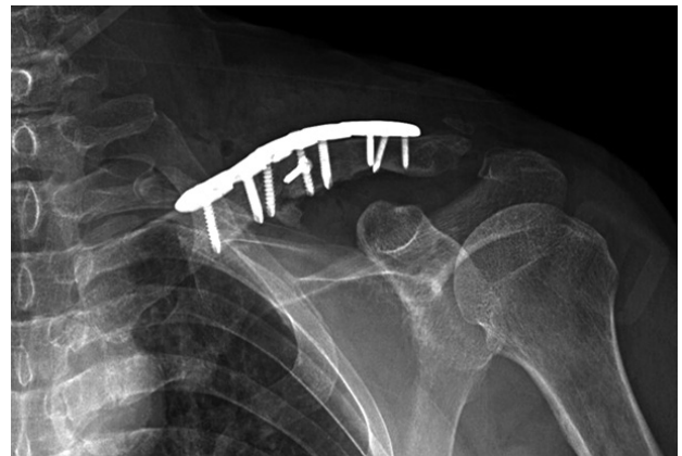
Fig. 2. Immediate postoperative left clavicle anteroposterior view after the first surgery.

Postoperative neurovascular status was intact, and we found no abnormal findings until postoperative day 3. On postoperative day 4, the patient presented with numbness in the left hand and decreased strength. A grade 1/5 in thumb extension and flexion, wrist extension, and finger extension, flexion, and abduction was found in addition to a grade 3/5 in wrist flexion and elbow flexion and extension. A haematoma formation at the operation site was suspected because