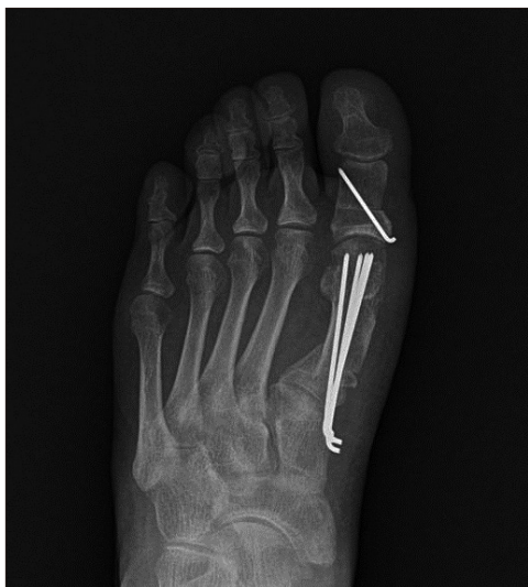
Figure 4. Postoperative radiograph shows satisfactory reduction of hallux valgus deformity.

the metatarsal head. The correction was then checked using C-arm fluoroscopy (Fig. 2). The Kirschner wires were buried under skin and a bone graft was prepared using resected bone, and was placed in the gap of the osteotomy site (Fig. 3). The medial joint capsule was repaired using absorbable sutures, and correction was rechecked using C-arm fluoroscopy after wound closure (Fig. 4).