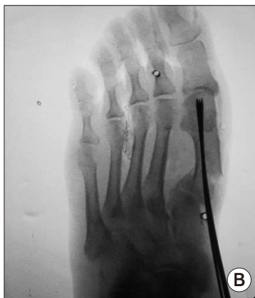
Figure 2. (A) Intraoperative photograph shows the distal fragment was medially translated. (B) Fluoroscopic image shows medial displacement and lateral angulation of the distal fragment.