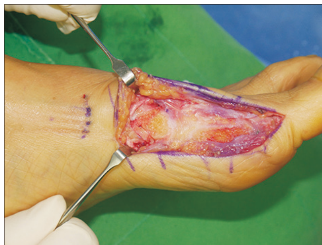
Figure 3. The bunion is removed and a bone graft is prepared using resected bunion, and is placed in the gap of the osteotomy site.