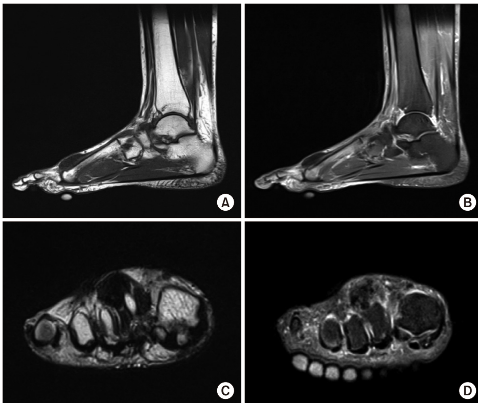
Figure 1. Magnetic resonance imaging (MRI) findings. (A) The tumor was well-defined heterogeneous low signal intensity on sagittal T1-weighted MRI image, located in the dorsal side of 2nd metatarsophalangeal (MTP) joint adjacent to the extensor digitorum longus (EDL) and extensor digitorum brevis (EDB). (B) The tumor shows same heterogeneous low signal intensity on sagittal T2-weighted MRI image. (C) Coronal T1-weighted MRI image revealing a mass firmly adherent to the dorsal side of 2nd MTP joint capsule and conjoined tendon of EDL and EDB. (D) The tumor on coronal T2-weighted MRI image shows same heterogeneous low signal intensity.

The patient left the hospital the 2 days after the operation with a simple compression dressing. After one month she returned to her normal foot activities with full range of motion. Perioperative complication wasn't occurred. At the 3 months follow-up, there was no evidence of clinical or radiological recurrence.