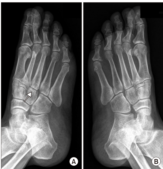
Figure 1. Medial oblique radiograph demonstrates the third metatarsal-lateral cuneiform joint irregularity (arrow) of the right foot (A) joint compared to left foot oblique view (B).

Having failed conservative management, the patient was given the option of arthrodesis of this joint as a means of definitive management. With the patient placed supine, longitudinal incision was made on the MT3-LC joint. Micromotion was observed by forceful dorso-plantar stress. The half of joint was connected with fibrocartilaginous tissue. We tried to remove the MT3-LC joint by en bloc resection. This was difficult due to deep and narrow joint space. Arthrodesis was performed using a strut iliac bone graft and fixed