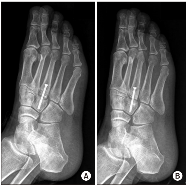
Figure 4. Postoperative radiographs of the right the third metatarsal-lateral cuneiform joint demonstrates non-union on first trial (A) and second trial (B).

with one 4.0 mm cannulated screw, followed by a nonweightbearing cast for 6 weeks. Partial weightbearing and active range of motion exercise commenced at 6 weeks postoperatively. The patient complained of pain 3 months after first operation. A follow-up radiograph revealed that fusion had not been achieved (Fig. 4A). Second operation for fusion was tried using cancellous bone graft on bed for shell-outed non-union site and one 4.0 mm cannulated screw 6 months after first trial. Continuous pain on walk after the same rehabilitation protocol was present, as is in the first operation. Non-union was again confirmed in a follow-up radiograph (Fig. 4B). The reason of the failure was assumed that compression was not enough due to resistance of the intercuneiform and metatarsal ligaments. We blocked out the plantar and dorsal cortex around MT3-LC joint while remaining surrounding ligaments, and inserted a strut block bone harvested at the iliac crest tightly and fixed with low-profile plate and screws. Follow-up radiographs at 1 year postoperatively revealed bone union on MT3-LC joint within tolerable pain (VAS 20) (Fig. 5). At that time the patient had no subjective complaints of pain or instability regardless of activity level.