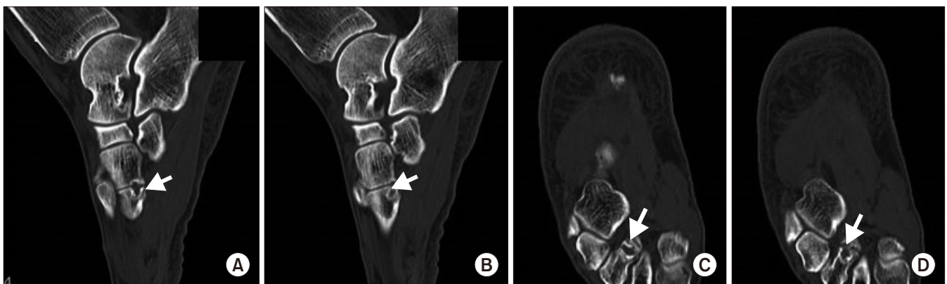
Figure 2. Computed tomography scans of the right foot demonstrates cortical irregularity (A, C) and subchondral cyst (B, D) of the third metatarsal-lateral cuneiform joint (arrows).