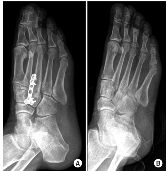
Figure 5. (A, B) Postoperative radiographs of the right the third metatarsal-lateral cuneiform joint demonstrates union on third trial.

The incidence of the MT3-LC coalition reportedly ranges from