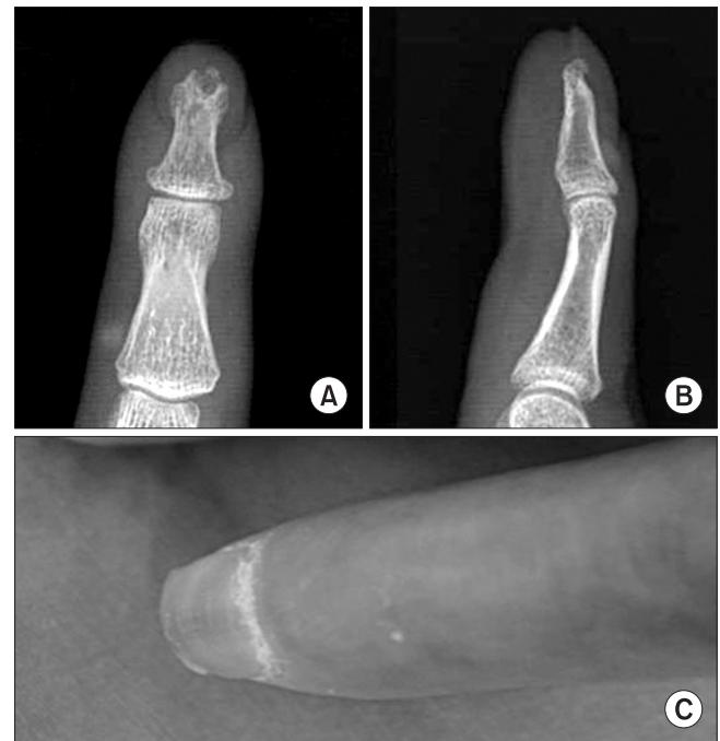
Fig. 4. (A, B) Anteroposterior and lateral radiographs 14 months after curettage show diminished radiolucent lesion and progression of union compared with previous radiographs. (C) Gross finding shows nail deformity 14 months after operation.

Epidermal cysts, also called epidermal inclusion cysts, are common, but intraosseous epidermal cysts are rare. Epidermal cysts usually invade the skull and phalangeal bone. They occur frequently in people aged 20 to 40 years. 1-3) According to some studies, epidermal cells implanted in bony tissue after trauma or surgery may give rise to these cysts. 2) They have also been attributed to the expansion of populations of embryonic cells that exist congenitally in bone. 2,4) Symptoms of epidermal cysts are a slightly enlarged finger, with a rubbery to firm texture, often with tenderness. Most epidermal cysts do not invade the joint or limit the range of motion. 1,2) Epidermal cysts at the distal phalanx are the most common site in the hand. Such cysts show up as a concentric pattern in bone radiographs. Other characteristics include an osteo-destructive lesion in the center, an expanded cortex, and a radiolucent lesion with well-defined margins. Gross findings intraoperatively in the cyst, the cystic cavity is found. It has the internal lining which is easily separated from the surrounding bone. The cystic cavity is sometimes empty, but it is