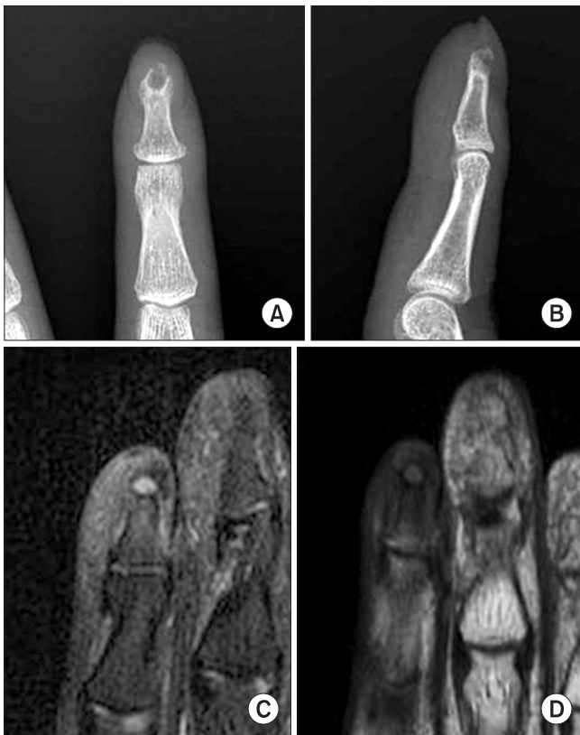
Fig. 3. (A, B) Radiographs show a round shaped radiolucent lesion with cortical expansion and thinning of left 4th finger. (C, D) T1-weighted and T2-weighted MR images show lower and higher signal lesion at the left 4th distal phalanx.