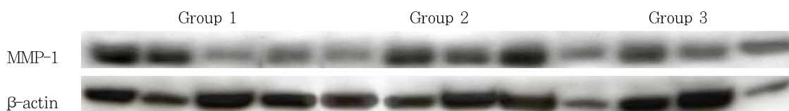
Figure 1. Western analysis of samples for MMP-1. MMP-1 corresponding to molecular weight 53 kDa was expressed in all samples including healthy gingiva, and expression of MMP-1 was increased in Group 2 than Group 1, 3. In order to quantify detected MMP-1, normalization to \beta -actin was performed.

MMP-1 levels of gingival tissue samples were varied within the same group(Table 1). The mean amount of MMP-1 in group 1, 2 and group 3 was 1.009, 1.209 and 1.104, respectively. But, the differences among 3 groups were not statistically significant ( P > 0.05 ). It is because sample size was too small and various factor of each individuals was not excluded.