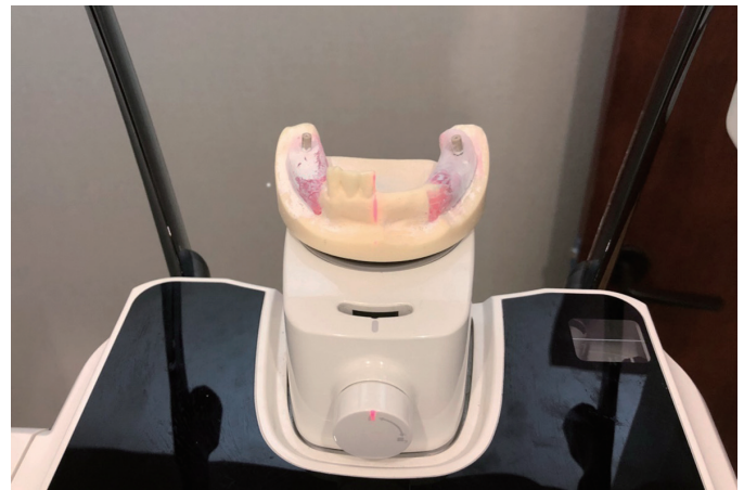
Fig. 1. Cone-beam computed tomography taking of study model.

The STL and DICOM data were imported into a dental software program (R2GATE v1.1.1, MegaGen, Daegu, Korea) for computer-aided implant surgery planning and guide fabrication. Using volume rendering, the DICOM data were reformatted as a 3D reconstruction image with which the surface scan data were merged. The image registration was conducted manually by designating 3 congruent points from the two images. The registration process was carried out two times per each operator with different matching conditions (Fig. 2). In the first matching, matching points were limited to the remaining teeth. In the second matching, the scan cap images were included as matching areas, as well as the tooth image. Twelve dental graduates who were blinded to the purpose of study and had same the working year in the dental filed, participated in this study. While performing the registration process, working time was recorded for each condi-