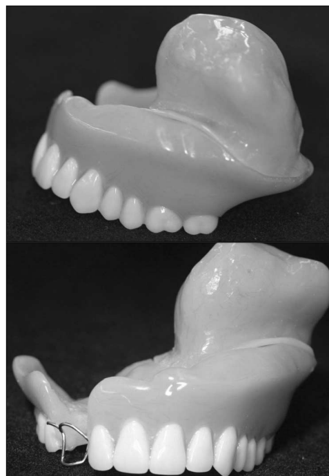
Fig. 4. The extraoral lateral and front view of compiled prosthesis.

The obturator was fully seated and confirmed that the prosthesis was easily placed and removed by the patient. A further irreversible hydrocolloid impression with the obturator in position was taken and the maxillary denture was constructed in a conventional manner. Meanwhile in the laboratory, two dental magnet attachments (Magfit EX 600, Aichi Steel Corporation, Tokai-shi, Japan) were placed