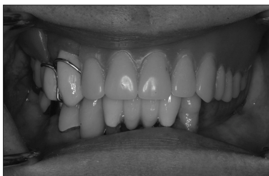
Fig. 5. The intraoral view of the prosthesis in position.

with an individual tray using a modeling plastic impression compound (Modelling compound medium, GC Co., Tokyo, Japan) and addition silicon (Aquasil XLV Ultra, Dentsply, Milford, USA) with the wash impression technique. The obturator was constructed maximizing use of the lateral defect wall and bucco-anterior undercut, and a small extension of approximately 5 mm over the palatal surface at the defective margin was placed to prevent vertical displacement of the obturator. The palatal surface of the obturator was designed with two small positioning references of small semi circular indentations and projections. The insertion of the obturator into the defect was possible in a rotational path; from medio-distal to bucco-anterior (Fig. 2 a, b).