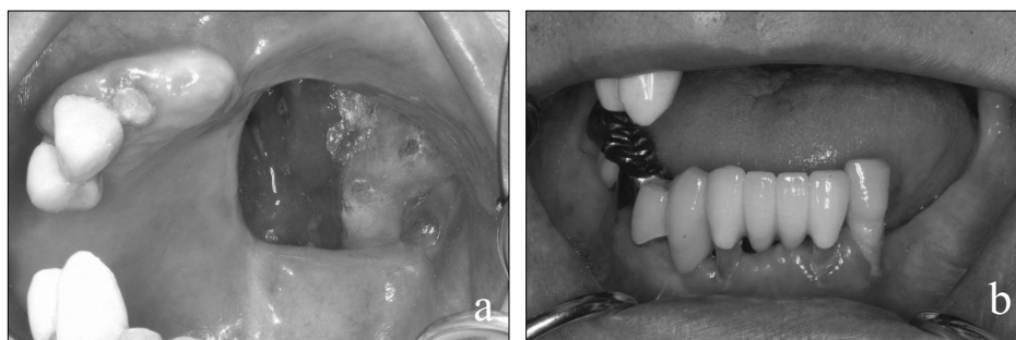
Fig. 1. a The occlusal view of the healed maxilla after a subtotal maxillectomy and radiotherapy. b Limited maximum intercanine distance even after use of tongueblades to improve mouth opening due to trismus.

The primary impression for the obturator was made with wax (Utility Wax, Daedong In., Daegu, Korea) and irreversible hydrocolloid, followed by the final impression