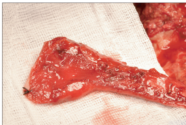
Fig. 2. Vascularized calvarial bone was harvested.