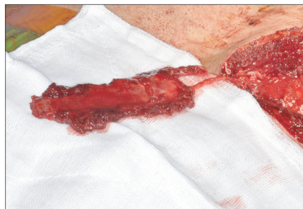
Fig. 3. Ipsilateral fourth rib was harvested.