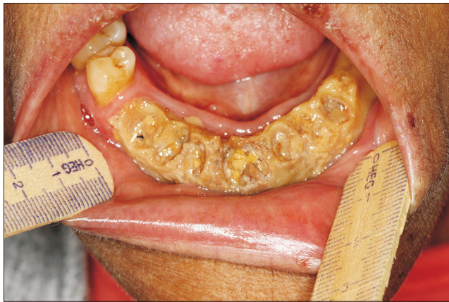
Fig. 1. Severe medication-related osteonecrosis of the jaw (MRONJ) in a patient with multiple myeloma who received pamidronate.

This was an observational cross-sectional study that evaluated patients treated with antiresorptive agents, previously or currently. All patients were assigned to the Department of Oral and Maxillofacial Surgery at Erasto Gaertner Cancer Center, referred by the clinical oncologist of the same institu-