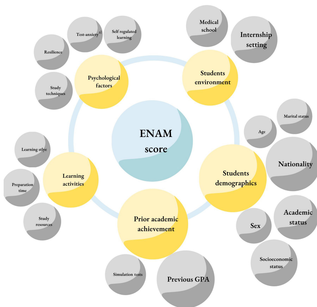
Fig. 2. Factors associated with National Licensing Examination (ENAM) scores using an academic achievement model. a Test-anxiety refers to a type of anxiety that appears in an evaluative or testing setting (i.e., exam-related). GPA, grade point average.

a For each point in GPA, the OR increased by 10.94. Academic honors: being on equal or higher than the 66th percentile. Graduation modality: If the acquisition of the degree was by thesis dissertation or by an examination.