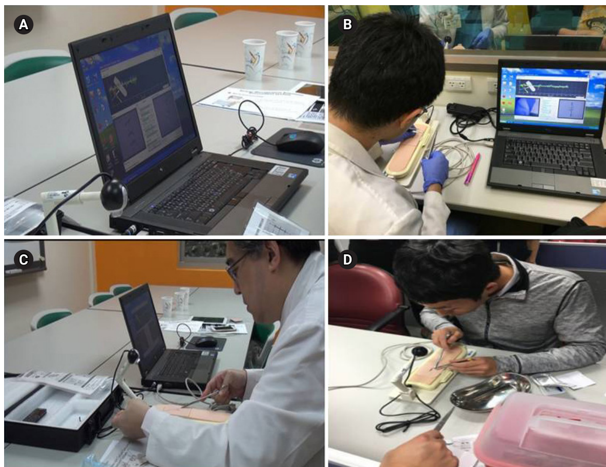
Fig. 1. (A-D) Photo of the AI assessment/training system for suturing/ligature skills and images of medical interns practicing.