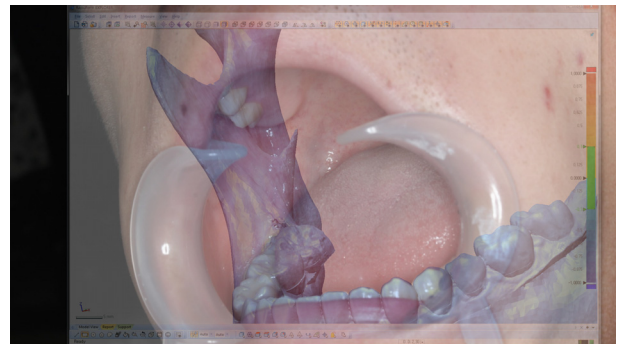
Fig. 6. Overlapping of the 3-dimensional mandibular images from the simulation software onto the intraoral photographs by matching positions of the teeth between the 3-dimensional mandibular images and intraoral photographs.

Using this simple AR method, the superimposed images