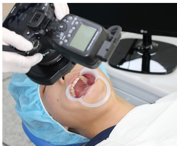
Fig. 2. Intraoral photographs were taken from the angle at which the clinician used to look down at the patient's oral cavity for a right-sided inferior alveolar nerve block anesthesia.