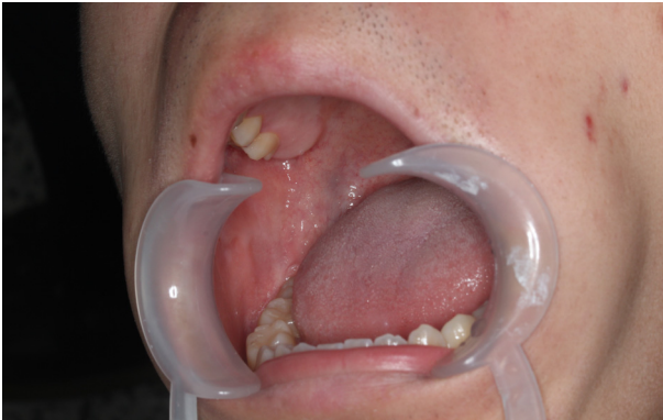
Fig. 3. Intraoral photographs were taken from the angle at which the clinician used to look down at the patient's oral cavity for injection of local anesthetics for right side inferior alveolar nerve block anesthesia.

a digital camera was used to take intraoral photographs to obtain the images of the actual oral cavity immediately before administering inferior alveolar nerve block anesthesia. In such cases, the patient was instructed to open his or her mouth in the same manner as during an inferior alveolar nerve block. The intraoral photographs were taken from an angle similar to the one the clinician