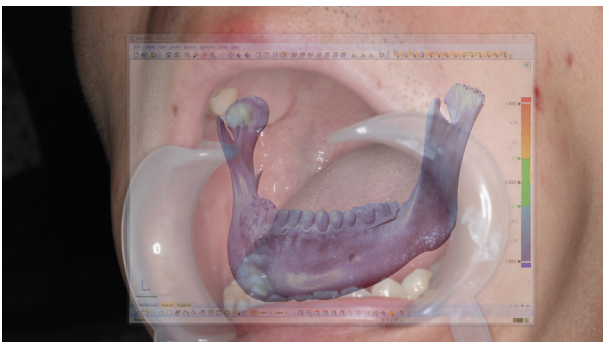
Fig. 5. Adjustment of the window transparency of the 3-dimensional simulation software to enable visualization of the intraoral photograph through the 3-dimensional mandibular image.

would use to look down at the patient's oral cavity during the injection of a local anesthetic (Fig. 2). These photographs were uploaded to a computer to be overlapped with the 3D mandibular images (Fig. 3). Next, the 3D mandibular images displayed on the software were arbitrarily overlapped with the intraoral photographs on the computer screen (Fig. 4). Another software program was used to adjust the window transparency of the software displaying the 3D images of the mandible, until the intraoral photographs were visible in the background (Fig. 5). Finally, the 3D mandibular images were enlarged, reduced, rotated, and positioned as needed so that the positions of the teeth in the 3D images matched those in the intraoral photographs (Fig. 6).