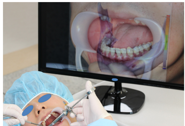
Fig. 7. Performing of an inferior alveolar nerve block procedure using a simple augmented reality method, in which the superimposed images are used as references to locate the mandibular foramen in an intraoral view during the injection of local anesthetics.