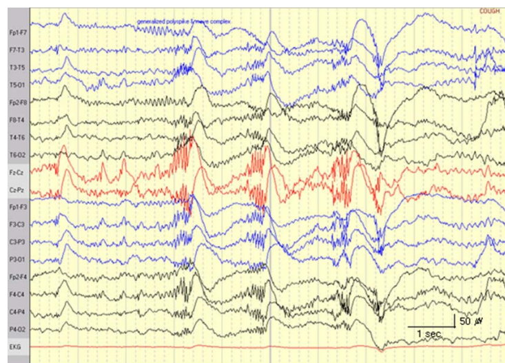
Figure 2. Example EEGs showing polyspike-and-wave complexes without rhythmic fast activity.

the troponin-I level was 0.12 ng/ml, and the fever had normalized.