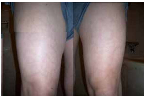
Figure 1. A mottled, net-like purplish discolorations of both legs suggesting livedo reticularis, which aggravated with cold temperature, but did not disappear after warming-up or elevation of limbs.

bilateral gaze-evoked nystagmus. Mild weakness in muscle power was noted in the left extremities, but sensory seemed to be symmetric to painful stimuli. Deep tendon reflexes were hyperactive in both sides. Neck was supple and carotid or ophthalmic bruits were not audible.