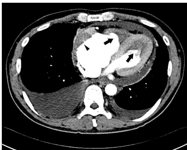
Fig. 2. Computerized tomography of the chest showed apical obliterations of both ventricles by non-enhanced homogenous materials (arrow) consistent with the echocardiographic findings. The non-enhanced density material (arrowhead) was also noted in the enlarged right atrium.

infiltration of the ventricular endocardium, with subsequent degranulation and necrosis with resultant endomyocardial fibrosis, leading to apical thrombotic obliteration. In addition, the intensive inflammatory changes result in superimposed thrombus formation, which subsequently occupies much of the ventricular cavity. 7-9) The presence of asymptomatic endomyocardial lesions may precede overt cardiac disease by a substantial period of time. 10) Valvular involvement, as well as endocardial involvement, includes tricuspid, mitral, and aortic valve regurgitation caused by endocardial inflammation, and fibrosis affecting papillary muscles and chordae tendineae producing papillary muscle dysfunction. 11)