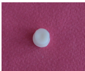
Fig. 2. Fabricated zirconia CAD/CAM coping.

In order to eliminate the effect of impression and pouring variations, the metallic die was used as the definitive die. The die was sprayed with scan spray and scanned using a 3D-laser scanner (3ShapeD810; 3Shape, Copenhagen K, Denmark). The data were transferred to CAD software (3Shape's CAD Design software; 3Shape, Copenhagen K, Denmark) in which the copings were designed with a uniform thickness of 0.5 mm around, considering 30 \mu m spacer, and 1 mm short of the margin. In the occlusal surface a depression was designed to accommodate the tip of the holding device (Fig. 2). Thirty zirconia copings were milled from pre-sintered Y-TZP blanks (IPS e.max ZirCAD, Ivoclar Vivadent) in a milling machine (inLab MC XL, Sirona) in a