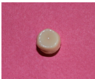
Fig. 5. Fabricated zirconia CAD/CAM crown.

ensure the same seating of them as copings on the die (Fig. 5).