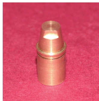
Fig. 1. Brass master die.

Ceramic materials investigated in this study were displayed in Table 1. A brass master die was machined to approximate dimension of a prepared molar for an all ceramic restoration with 7 mm height, 6 degree of occlusal convergence and a 90 degree shoulder of 1 mm wide finish line (Fig. 1). Preparation of master die was free of any irregular-