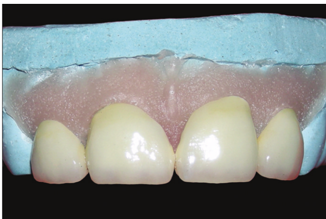
Fig. 5. Fabrication and evaluation of axial contours of the fixed partial denture on the modified soft tissue cast.