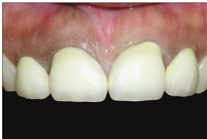
Fig. 6. Fixed partial denture in place with correct gingival emergence profile.