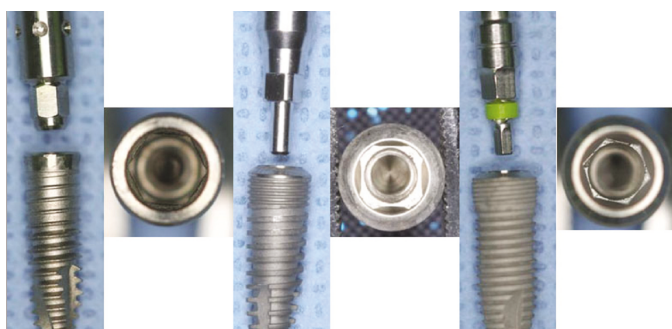
Fig. 1. Xive, Implant Magicgrip, Implantium MF implants and corresponding implant drivers (from left to right) and the internal surfaces.