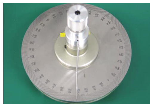
Fig. 2. A device for measuring the amount of rotation.