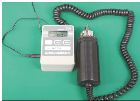
Fig. 3. The digital torque gauge used in current study.

In the current study, rotational freedom between an implant and its abutment were evaluated using three internal connection