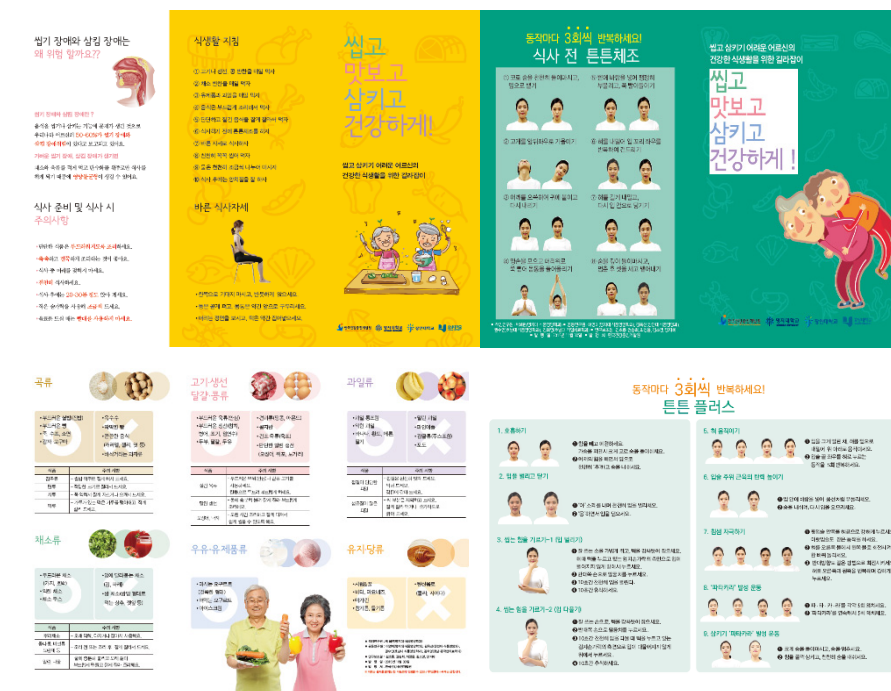
Fig. 2. Contents of the educational program for improving the dietary quality: Dietary guide and exercise guide

The educational program was administered to the experimental group. Guides including dietary (food, cooking, and menus) and exercise (posture at mealtimes, 'Health Stretching', and 'Health Plus Stretching') were