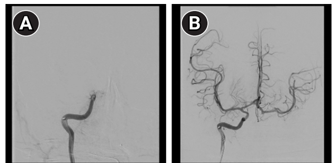
Fig. 1. Digital subtraction angiography performed on the second day of admission. Images were captured by interventional radiologist utilizing digital subtraction angiography. (A) Image demonstrates thrombus present in the internal carotid artery with downstream circulation blocked. (B) Image demonstrates revascularization after successful removal of thrombus via thrombectomy.

One week later, the patient was admitted to the NCCU for sup-