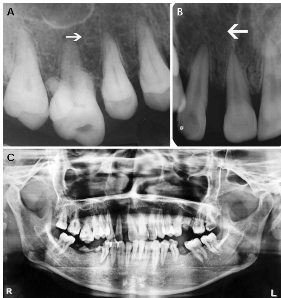
Fig. 2. Intraoral periapical radiographs show coarse bony trabeculae and enlarged marrow spaces. A. Right maxillary posterior portion. B. Right maxillary anterior portion. C: Panoramic radiograph shows an ill-defined irregular area of bone destruction in right maxillary anterior region.

and enlarged marrow spaces on the right maxillary anterior and posterior regions. Alveolar bone loss was revealed on the maxillary central and lateral incisor regions. Widening of periodontal ligament space was seen with lateral incisor, first and second premolar and the first molar was supraerupted (Figs. 2A and B). Panoramic radiograph showed ill-defined, irregular area of bone destruction extending from the mesial surface of the left maxillary central incisor upto the mesial surface of the right maxillary canine. The maxillary central and lateral incisors showed marked displacement (Fig. 2C).