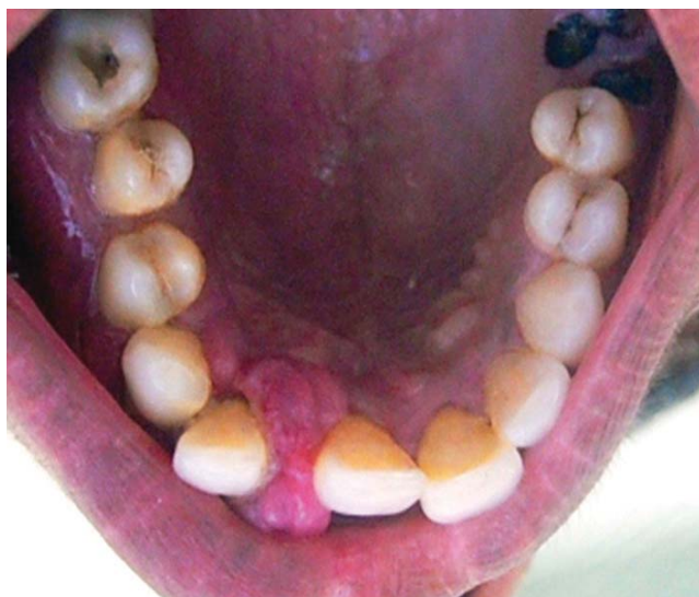
Fig. 4. Post-operative intraoral photograph shows regression of palatal lesion after selective embolization.

cedure well and had an unremarkable postoperative course. One week postoperatively the patient showed complete regression of the palatal lesion (Fig. 4). One year follow-up revealed a significant reduction of clinical symptoms