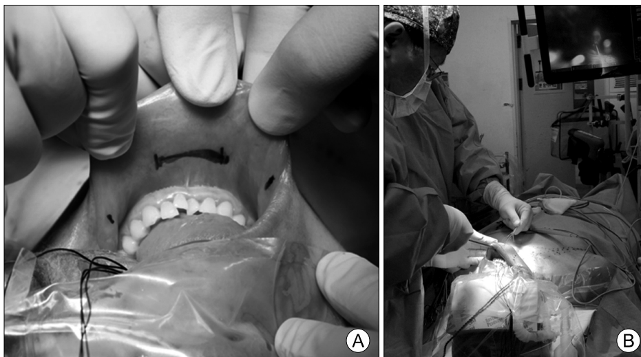
Fig. 1. (A) Location of incisions. (B) Blunt dissection with 8-mm-tipped vascular surgical tunneler.

Once an adequate flap is created, the endoscope cannula is inserted. CO 2 insufflation (5–7 mmHg) is introduced and maintained via the central port. A similar blunt dissection is also performed through the two lateral incision sites, allowing insertion of the instrument cannulae into the subplatysmal working space. Next, standard laparoscopic instruments – a suction electrocautery and an ultrasonic shears – are used to elevate the platysma from the level of the mandible to the sternum inferiorly and laterally to the sternocleidomastoid muscles (Fig. 2A). Subsequently, an 8-mm bariatric trocar can be inserted through an incision made along the patient's right axillar fold into the sub-