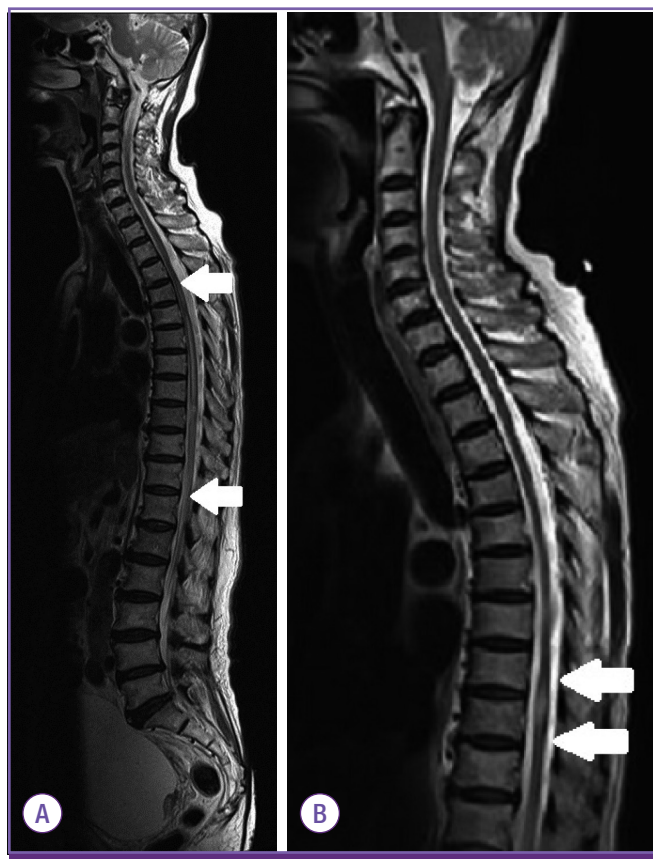
Figure 2. Whole spine MRI (T2-weighted sagittal image) on admission (A) shows high-signal intensity from level T4 (upper arrow) to T11 (lower arrow). On admission day 36 (B), the extent of diffuse hyperintensity decreased, with faint enhancement of the spinal cord from level T8–T9 (upper arrow) to T9 (lower arrow).

common manifestation of VZV reactivation is herpes zoster. Unvaccinated individuals aged 85 years or older have a 50% risk of developing herpes zoster [10]. However, transverse myelitis is one of the rarest complications, particularly in immunocompetent patients [1-3]. To date, five cases of VZV myelitis have been reported in Korea; however, most of them were clinically suspicious cases with consistent image findings [5-9]. Only one microbiologically confirmed case of transverse myelitis caused by VZV was reported approximately 20 years ago [6]. Four other reported cases of VZV in Korea were diagnosed by classical imaging findings and clinical examination.