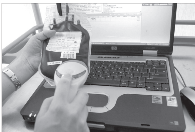
Figure 2. Barcode system for blood transfusion.

Declaring itself to be a filmless digital hospital, SNUH adopted PACS in July 2001. Since then, it has used the PACS effectively for patient care, research, and education. There are many kinds of PACS in SNUH: PACS for still images, video PACS for endoscope video images, PACS for cardiovascular center, radiotherapy PACS, 3D PACS for three-dimensional volume rendering, virtual private network PACS for interpretation of images in case of emergencies outside the hospi-