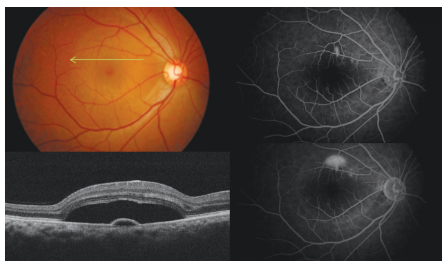
Fig. 1. Representative case of acute central serous chorioretinopathy. Top left, fundus photography shows discrete, clear and serous elevation in central area. Green arrow indicates the area of section on optical coherence tomography. Bottom left, optical coherence tomography shows subretinal fluid, thickened posterior surface of detached retina and semicircular pigment epithelial detachment. Right, fluorescein angiography shows smoke-stack like dye leakage (Top; early phase, bottom; late phase).

A discrete, clear and serous elevated lesion is observed at the posterior pole (Fig 1). In chronic form, multiple small deposits are observed between the RPE and sensory retina. RPEDs can be observed within or near the area of sensory retinal detachment. The characteristics of subretinal fluid is mostly clear but can be turbid due to fibrous deposits in some chronic, recurrent or atypical cases induced by pregnancy, steroid usage or organ-transplant. Persistent subretinal fibrin can resolve spontaneously or remain as sequelae such as macular atrophy, secondary choroidal neovascularization (CNV) or fibrous scar, resulting in permanent visual loss. Subretinal fluid moves downward under the influence of gravity, resulting in various shapes of sensory detachment such as tear, dumbbell, or flask [3,15,19,20]. Atrophic tract connecting posterior pole and inferior sensory detachment can be observed in some chronic cases, which can be more pronounced in FA and fundus autofluorescence (FAF) [21,32,33].