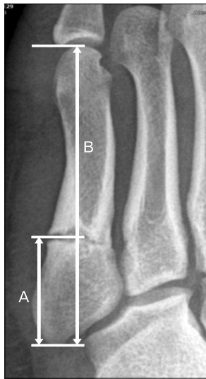
Fig. 1. The entire length of the fifth metatarsal was measured on a 30-degree internal oblique view. The distance from tuberosity to the fracture line was measured. The ratio between the entire length and the distance from tuberosity to the fracture (A, B) were calculated.

fracture line was limited to the proximal diaphyseal region for those patients. However, the fracture was located in zone II for the remaining eight cases. The fracture line was extended into fourth-fifth intermetatarsal articulation in five cases. The fracture line was limited in zone II even though there was no extended fracture line into medial cortex for three incomplete fracture cases.