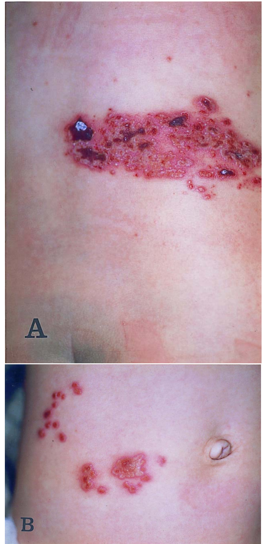
Fig. 1. Crops of papulovesicular eruptions and crusts scattered on right lower back, flank and lower abdominal area, corresponding to T11 dermatome. (A) On right lower back and flank area. (B) On right lower abdominal area.