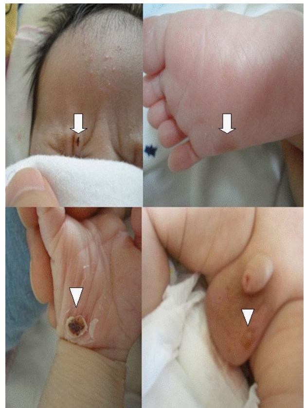
Fig. 1. On admission multiple ulcerative papules with crust and desquamation on the right eyelid and palm and erythematous macules and papules on the right sole were identified in addition to ulcerative papules and vesicles on the scrotum.

The patient's cerebrospinal fluid examination revealed values within normal limits (protein 54 mg/dL, glucose 82 mg/dL) and was negative for VDRL, bacterial and fungal culture, not including pleocytosis