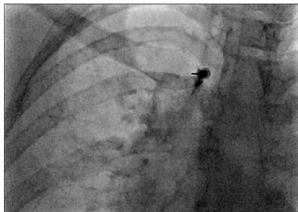
Fig. 2. Contrast spread inside SCJ sternoclavicular joint.

There are only a few reports about steroid injection into the SCJ under fluoroscopy guidance. One of these reports is the one reported by Galla et al. [6], in which 40 mg methyl prednisolone and 1 ml bupivacaine were injected