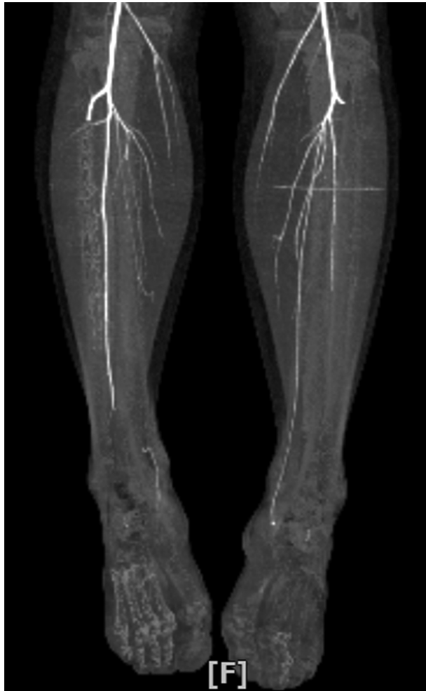
Fig. 2. Patient's CT angiography of lower extremities to assay the donor site bone and vessels.