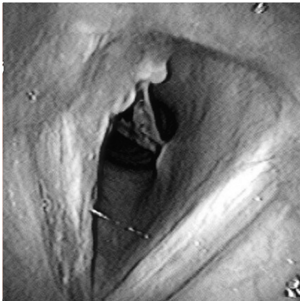
Fig. 2. A 2-cm sized fish bone was disengaged from the subglottic mucosa.