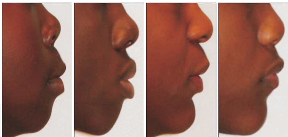
Figure 1. Four examples of modified profilograms excluding the upper third of the face but showing the facial complexion for African American orthodontic patients. In this way, degrees of lip protrusiveness can be perceived without bias associated with skin color.

A total of 20 orthodontists were selected to participate as evaluators to determine favorable African American profiles. The orthodontists were recruited in 2 groups; 10 experienced (or older) and 10 younger generations. The inclusion criteria for the experienced orthodontists were as follows: graduation from an American Dental Association (ADA)-accredited orthodontic residency program, currently practicing or teaching orthodontics, and at least 20 years of experience in the field of orthodontics. The inclusion criteria for the younger orthodontists were as follows: graduation from an ADA-accredited orthodontic residency program, currently practicing or teaching orthodontics, and less than 10 years of experience in the field of orthodontics. The majority of participants were practicing and teaching in