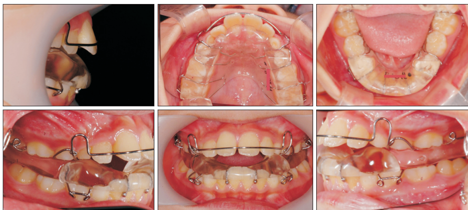
Figure 1. The Class II Twin-block appliance used in this study.

A modified form of Dr. Clark's Twin-block appliance comprising two separate, upper and lower, removable appliances was used in this study (Figure 1). The bite registration was taken with the incisors in an edge-to-