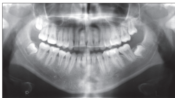
Figure 6. Panoramic radiograph of the patient aged 16 years and 6 months demonstrating that the mandibular right second premolar reached the occlusal plane at 8 years and 6 months after initial diagnosis. Note that the root formation was almost complete; however, the apex was still open.

In cases where there is an absence of a successor tooth, Lindqvist 8 recommends extraction of the retained mandibular deciduous second molar within the period between 8 years of age and completion of root development for the