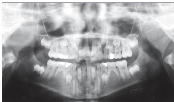
Figure 1. Panoramic radiograph of the patient aged 8 years and 1 month showing the absence of mandibular permanent second premolars.

Treatment of congenital tooth absence consists of 2 main treatment options: the first option involves replacing the residual space with implants or fixed prostheses and closing the spaces by moving the adjacent teeth into the residual space; the second option is to retain the deciduous tooth if its roots seem adequate, but modify its morphology if necessary. However, if the second option is chosen, orthodontists must keep in mind that prosthesis will have to be constructed anyway if the root of a deciduous tooth resorbs later in life. If not contraindicated, closing the space between missing teeth with the patient's own teeth is the most preferable option for both orthodontist and the patient. When this option is chosen, the orthodontist may perform this treatment without hesitation, including the extraction of the mandibular second deciduous molars to permit mesial drift of the first