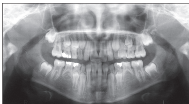
Figure 2. Panoramic radiograph of the patient aged 9 years and 6 months indicating mandibular right second premolar formation 17 months after initial diagnosis.

Deciduous second molar extractions were delayed because the patient was in early mixed dentition. The cross-bite of the maxillary left lateral incisor was corrected by using a removable appliance, including a labiolingual spring, for 2 months. The patient was then followed up every 4 months. Interestingly, a developing mandibular right second premolar was clearly observed on a panoramic radiograph approximately 17 months later when the patient was 9 years and 6 months old (Figure 2). The germ of the maxillary left third molar was also seen at the same time. Following this development, we revised the treatment plan and decided to wait for possible odontogenesis of the permanent left premolar as well as evaluate the calcification process of the right premolar. While there was no evidence of mandibular left second premolar odontogenesis at 2 years after the first appointment (when the patient was 10 years and 2 months old), calcification of the maxillary right third molar and crypt formation of the mandibular right third molar were observed (Figure 3). However, at this time the deciduous left second molar roots had resorbed, even though its successor was absent. Three years and 2 months after the first appointment, the mandibular left third molar's crypt formation was observed in addition to advancement of the other third molars and calcification of the mandibular right second premolar. Because the formation of all third molars occurred and there was no evidence of