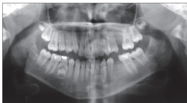
Figure 4. Panoramic radiograph of the patient demonstrating that mineralization of 3 third molars had begun while the fourth one was in the germ phase; therefore, agenesis diagnosis for the left premolar was given and the deciduous molar was extracted.

mandibular left second premolar odontogenesis, we considered this premolar to be congenitally absent. Following the revised treatment plan, the deciduous left second molar was extracted and the permanent left first molar was allowed to drift mesially (Figure 4). In addition, the maxillary left permanent second premolar was also extracted to establish a class I molar relationship. A removable appliance was constructed for both the lower and upper arch, and necessary adjustments were made to achieve parallel movement. After all permanent teeth reached occlusion, except the third molars and mandibular right second premolar, 0.018-inch slot Roth prescription brackets (American Orthodontics) were placed on both arches; leveling started with 0.012-inch nickel-titanium archwires. The spaces were closed, midlines were corrected, class I molar and canine relationships were achieved, and growth pattern remained almost stable after 19 months of fixed appliance therapy (Table 1). The mandibular right second premolar became exposed within the oral cavity 7 years and 4 months after the initial appointment (Figure 5) and reached occlusion