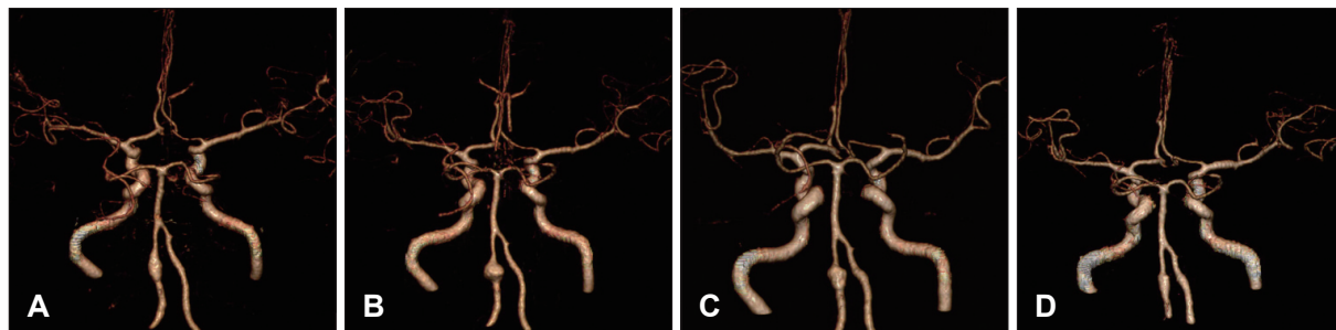
FIGURE 2. Case 4. A 56-year-old male with headache after a physical fight. A: Initial CTA showing fusiform aneurysm at left distal vertebral artery. B: After 5 months, increase in size and change in shape of the aneurysm from fusiform to globular. C: One month later, size of the aneurysm decreased reversely and its shape changed from globular to fusiform. D: The recent CTA, aneurysm became smaller. CTA: computed tomographic angiography.