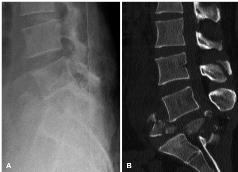
FIGURE 1. A: Fracture of the fifth lumbar vertebra-lateral view. B: Fracture of the fifth lumbar vertebra-CT sagittal reconstruction.

eurs, and pituitary graspers while the dura and root were protected with a nerve retractor. The expandable cage was filled with bone chips from the vertebral body to achieve fusion. After careful separation of the thecal sac, the Synex expandable cage for thoracic vertebrae, which is narrower than a lordotically curved lumbar one, was inserted between the bodies of L4 and S1 from the left side while simultaneously lifting the sacrum with the two L4 and alar screws inserted into iliac crest as well as distraction of the inserted Synex, and a favorable position of the spine was achieved