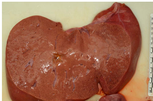
Fig. 1. The cut surface of the liver reveals yellow tan.

AFLP was suggested as a possible cause of death because major postmortem finding was macrovesicular and microvesicular steatosis in the liver, and there were