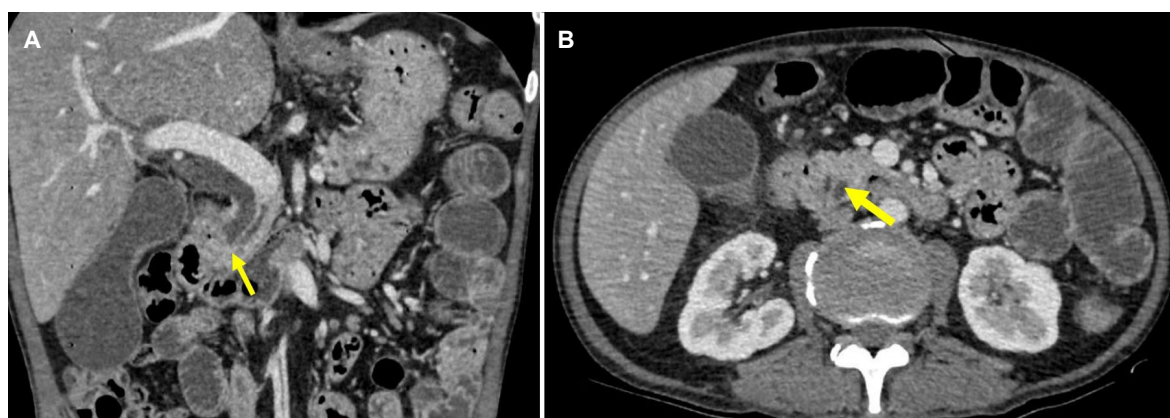
Fig. 1. CT findings. Abdominal CT, coronal plane (A), and transversal plane (B) showed the showing a soft tissue density filling defect in the distal common bile duct representing cancerous mass (the yellow arrows).

The patient underwent a venous Doppler ultrasound, which revealed a thrombus in the right femoral vein. The tumor