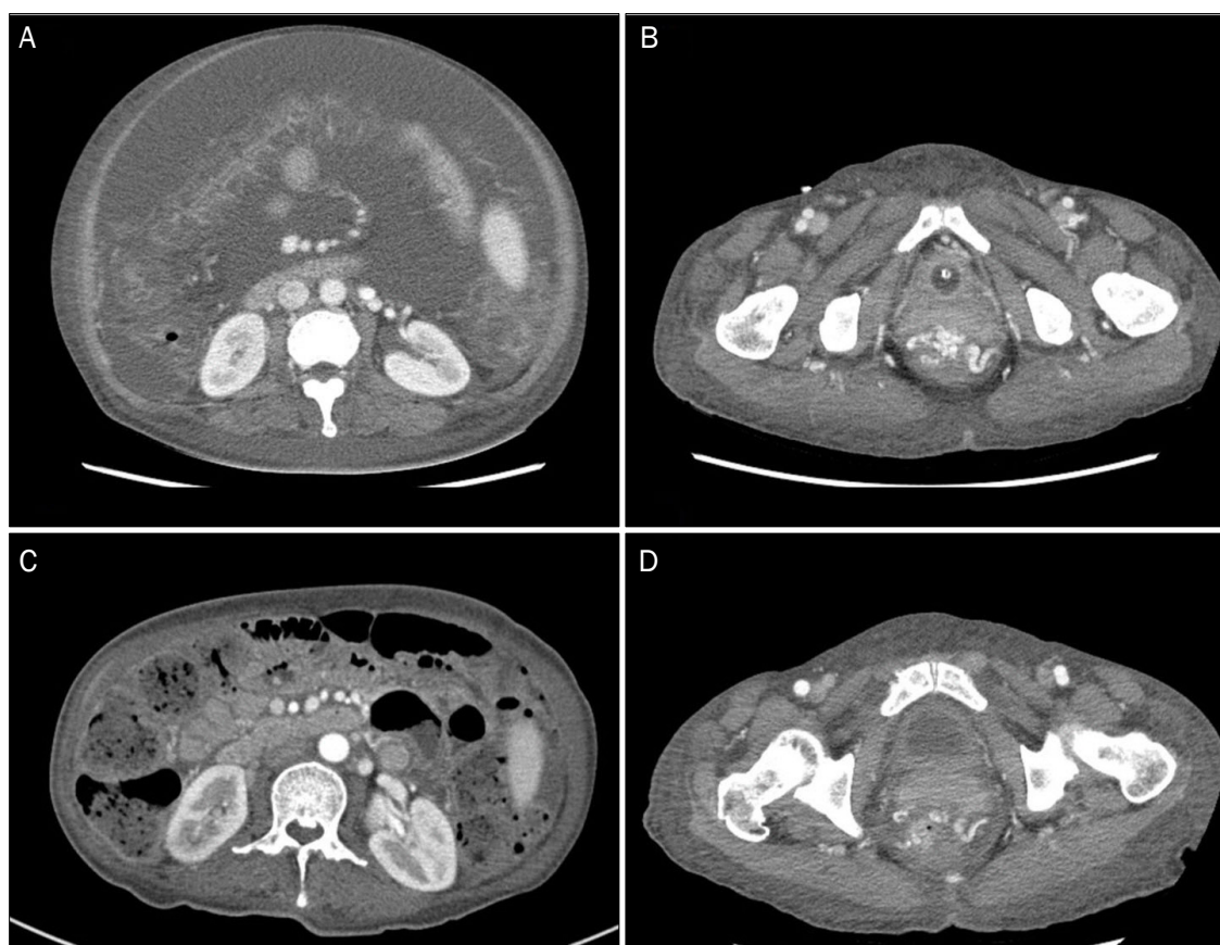
Fig. 2. An abdomino-pelvic computed tomography (CT) showing. Huge and tortuous varices in the anorectal region and large amount of ascites in the abdomino-pelvic cavity (A, B). A follow-up abdomino-pelvic CT two weeks after TIPS with embolization showed marked improvement of anorectal varices with a decrease in ascites (C, D).