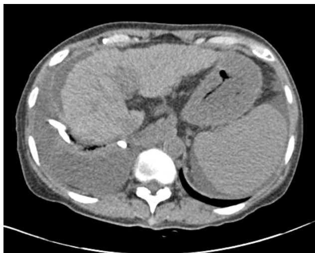
Fig. 1. Abdomen computed tomography finding at admission. The liver was shrunken and showed surface nodularity, and a moderate amount of ascites was noted near the liver. Right massive pleural effusion post pig-tail catheter drainage.

Finally, she chose to be discharged and to maintain the pig-tail catheter for persistent pleural effusion drainage. The amount of drained fluid reduced to 100 mL/day and catheter removal was possible at 40 days after insertion. DAA was maintained during the planned treatment period (12 weeks), and persistent viral suppression was accomplished at the end of the treatment period when liver function improved to Child-Pugh class B (Child-Turcotte-Pugh score 8). She underwent regular check-ups for liver function without recurrence of pleural effusion for 1 month after discharge (Fig. 2D), and after 24 weeks of therapy achieved sustained virologic response (SVR). HCV-RNA was at 8,470 IU/mL before the initiation of antiviral therapy and became undetectable at 12