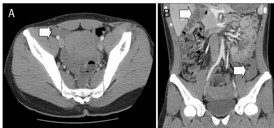
Fig. 2. Abdominal CT showed hyper-attenuated fluid collections (Hounsfield unit: 40-60) in the anterior aspect of the sigmoid colon of the pelvic cavity, both paracolic gutters and right subhepatic space, suggesting intraperitoneal hemorrhage (arrow: A, axial image; B, reformatted coronal image).