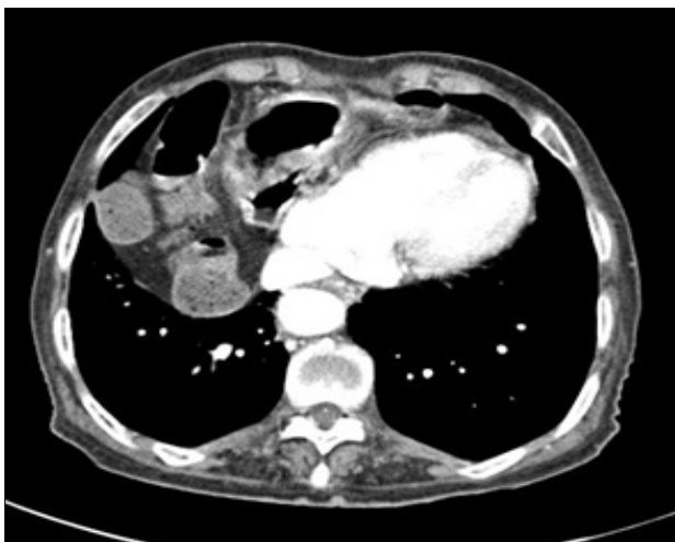
Fig. 2. A CT scan showing a right diaphragmatic hernia, with small and large bowel contents in the right hemithorax.

symptoms. Prior to her visit, she was prescribed prokinetics in a private hospital, but these were not effective. Recently, the discomfort had worsened, and she reported that she was unable to consume any food.