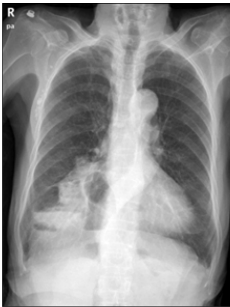
Fig. 1. A chest X-ray displaying air and gas above the right diaphragm, indicating a diaphragmatic hernia.