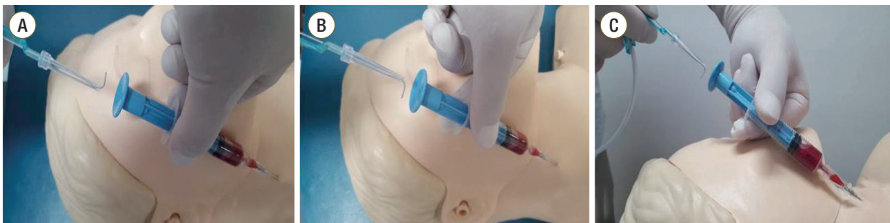
Fig. 2. Three different directions of the J-tip of the guidewire in central venous catheterization using the right internal jugular vein. (A) The J-tip medial-directed group (Group A), (B) the J-tip lateral-directed group (Group B), (C) the J-tip downward-directed group (Group C).