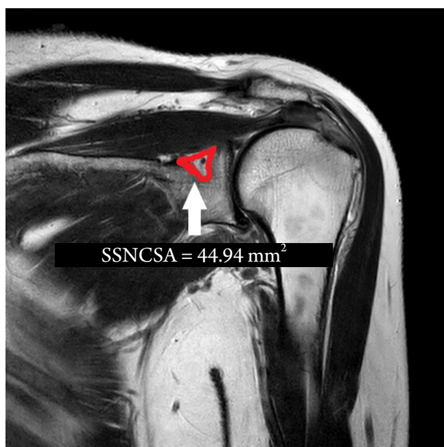
Fig. 1. Measurement of the SSNCSA (white arrow) was acquired via magnetic resonance T2 weighted images. SSNCSA: suprascapular notch cross-sectional area.

Demographic characteristics were not significantly different